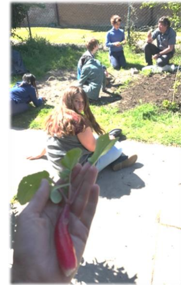
Class 7/8 harvested and sampled their first radishes today!